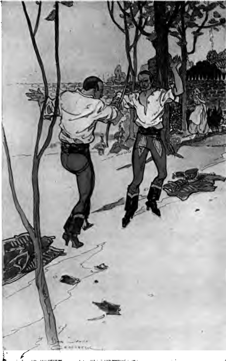
"The angry clash of arms filled that prim garden"